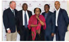
OR AWARDS ALUMNI WHO BRING HONOUR TO RHODES

YOUR SUPPORT OF THE ANNUAL FUND IS ESSENTIAL