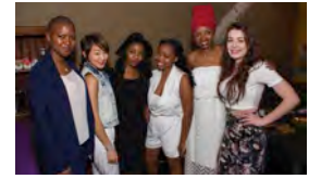
LELONA FUFU BENEFIT LUNCHEON CELEBRATING WOMEN