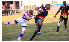
INTERVARSITY RIVALS RU RUGBY VICTORY